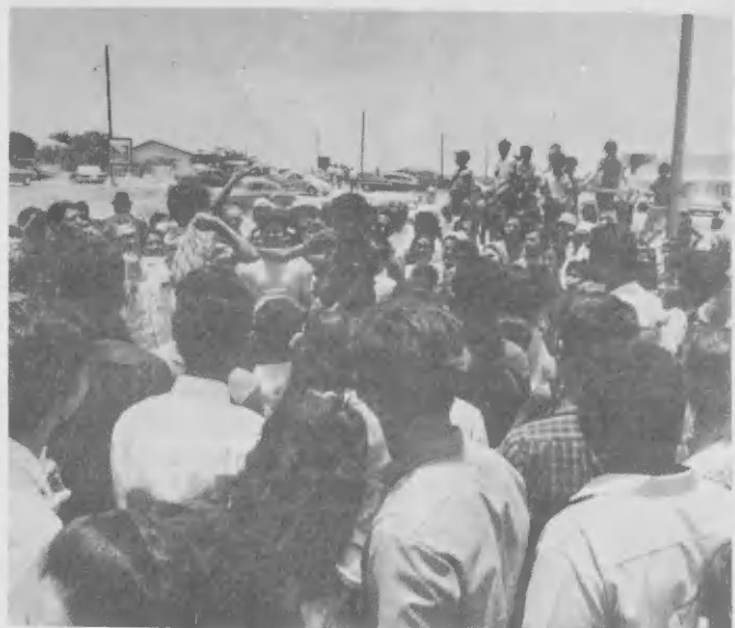
Pillow fight - Bringamento cu cusinchi.